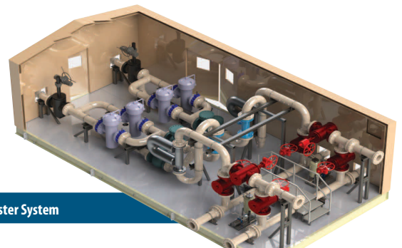
Pipeline Booster System