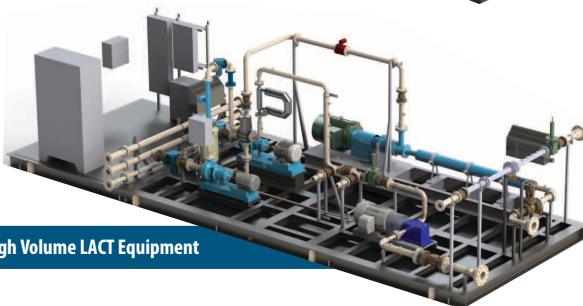
Custom High Volume LACT Equipment